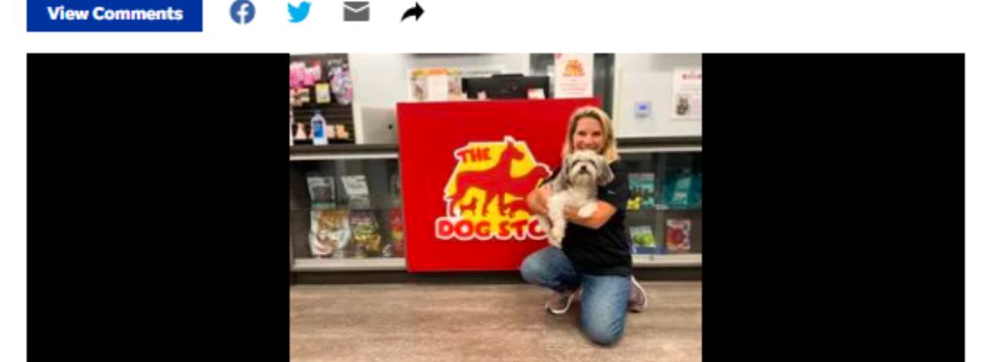
Located at 1175 Gulf Breeze Parkway, The Dog Stop in Gulf Breeze features luxury dog boarding accommodations, an interactive and social day care experience, a spa-like dog grooming retreat, holistic retail store and much more.

Make no bones about it, there's a new business occupying the 10,000-squarefoot space that was once the Tree House Cinema in Gulf Breeze.